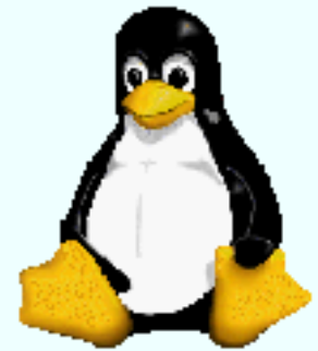
Penguin from Deep River, Ontario :-)

A Chinese translation of the "Linux Shortcuts and Commands" (ver. 0.32) is available here .